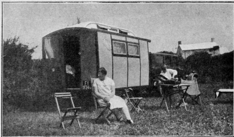
A "Record" in the Fields.

If you have only a small Car and a large party it is a good plan to take a small caravan, and a lean-to, thus providing for as many people as a larger caravan. Our Manager will always be glad to give you his advice on these matters.