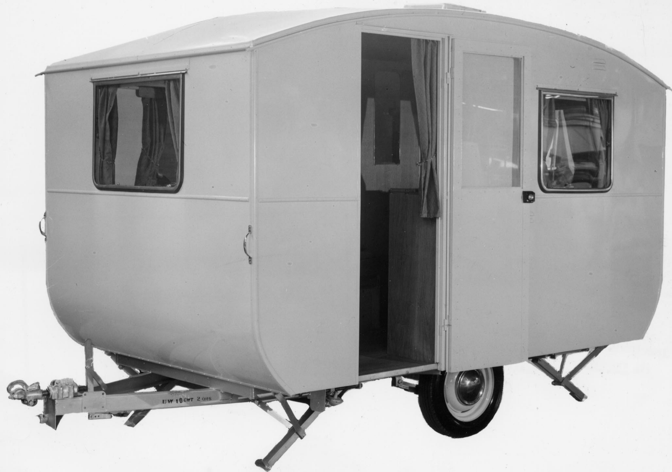
Eccles Coronet, 10ft x 6ft 4in