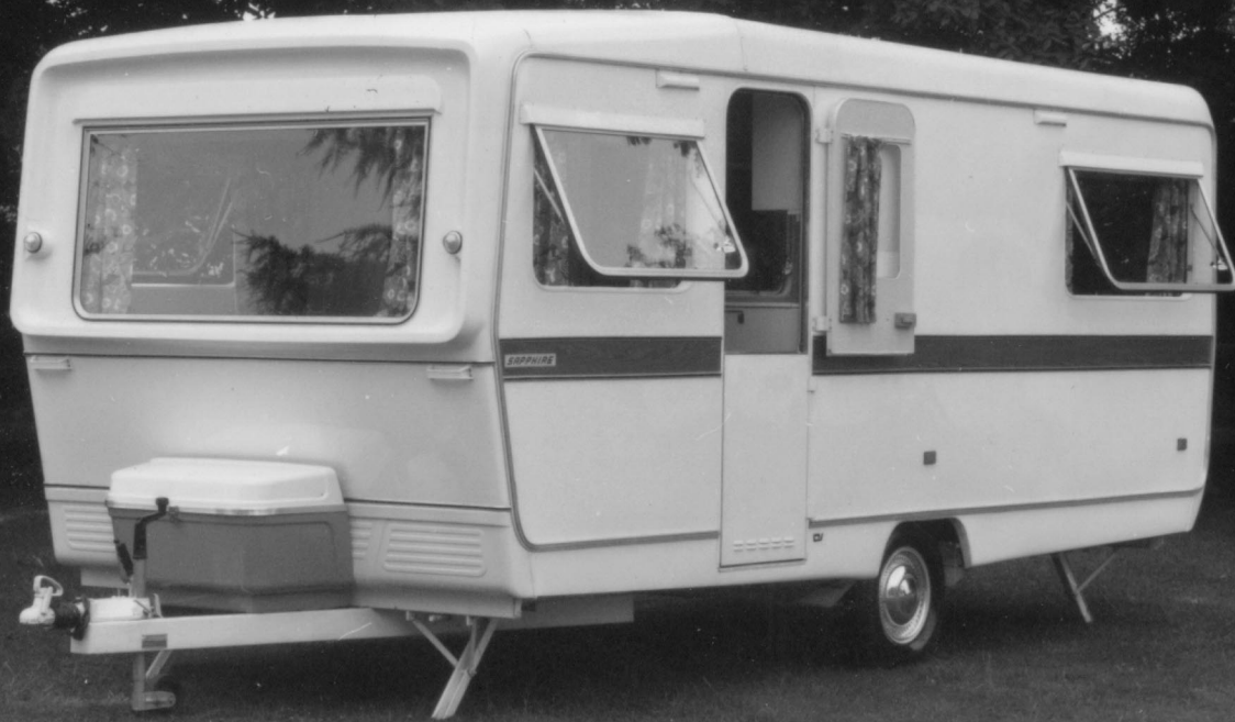
1973 Eccles Sapphire CK