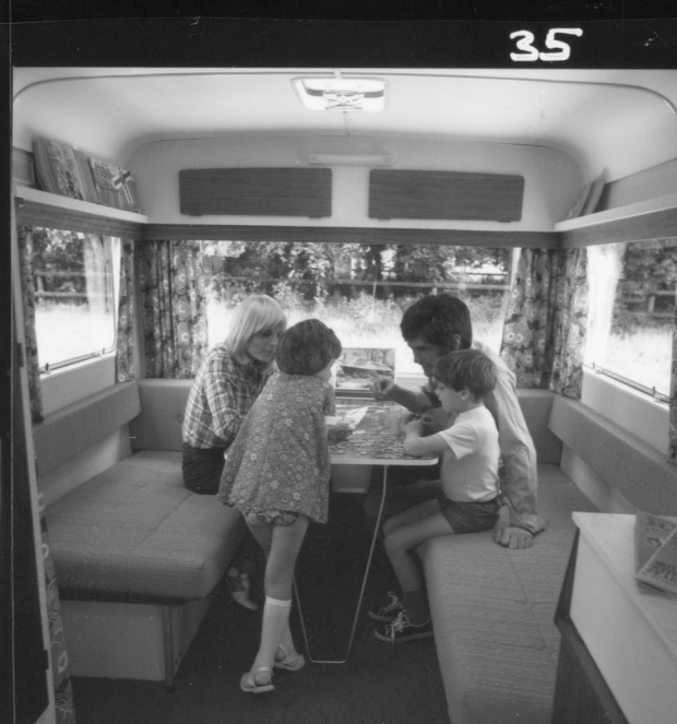
1973 Eccles Sapphire CK