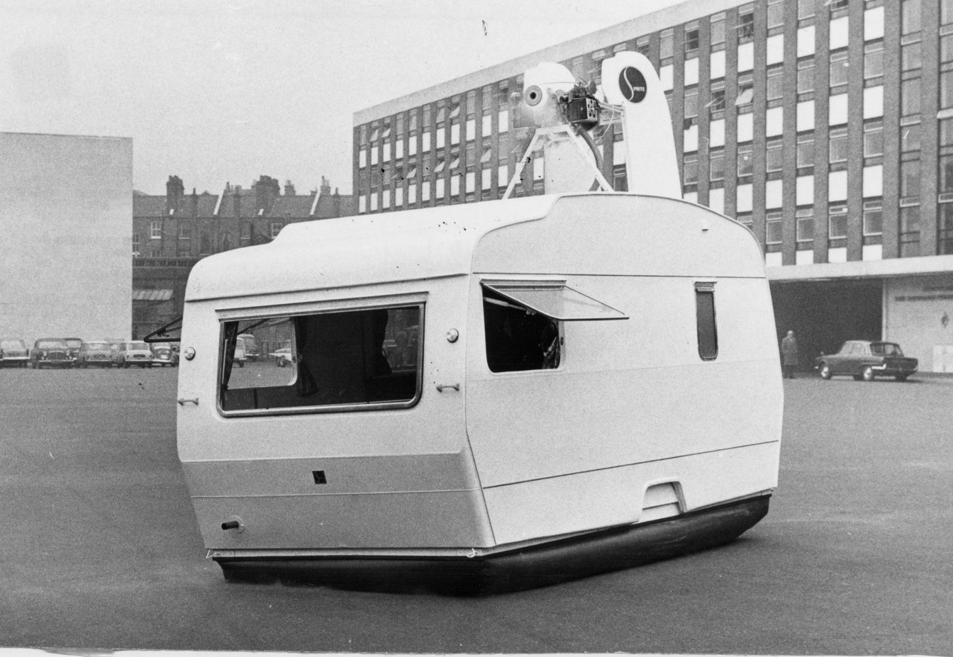
1970 Hover Sprite Publicity Gimmick