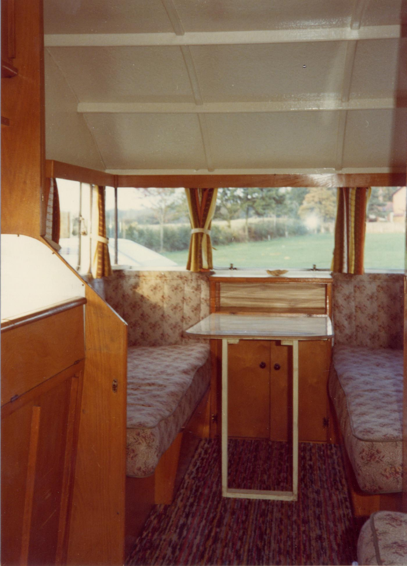
1956 Sprite 14