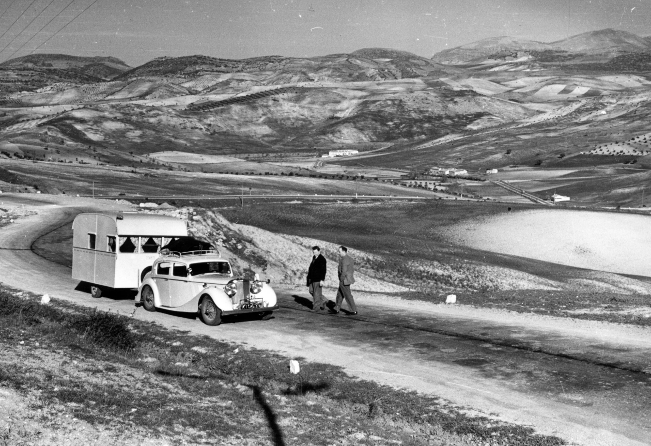
1952 Streamlite Sprite 11ft 10,000 mile Round the Mediterranean in 34 days.