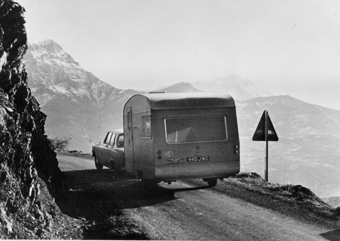
Sprite Alpine on Monte Carlo common route 1964