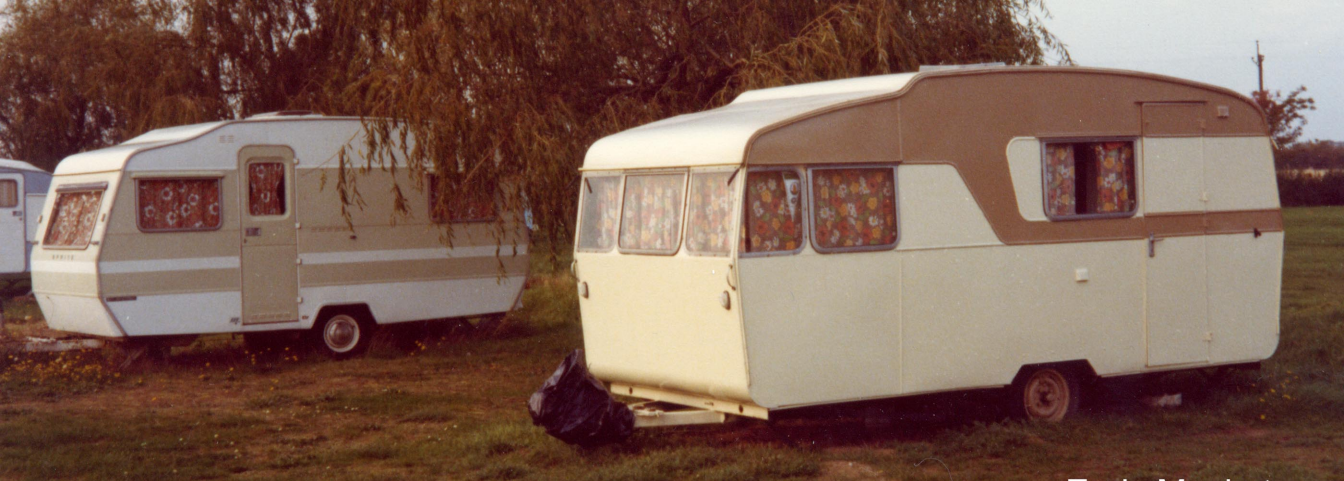
Early Musketeer