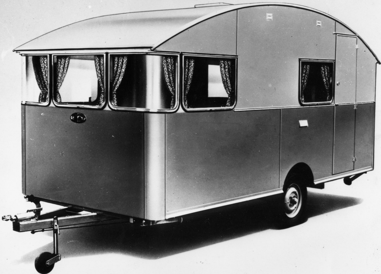
1954 Sprite 14. the year Streamlite was changed to Sprite.