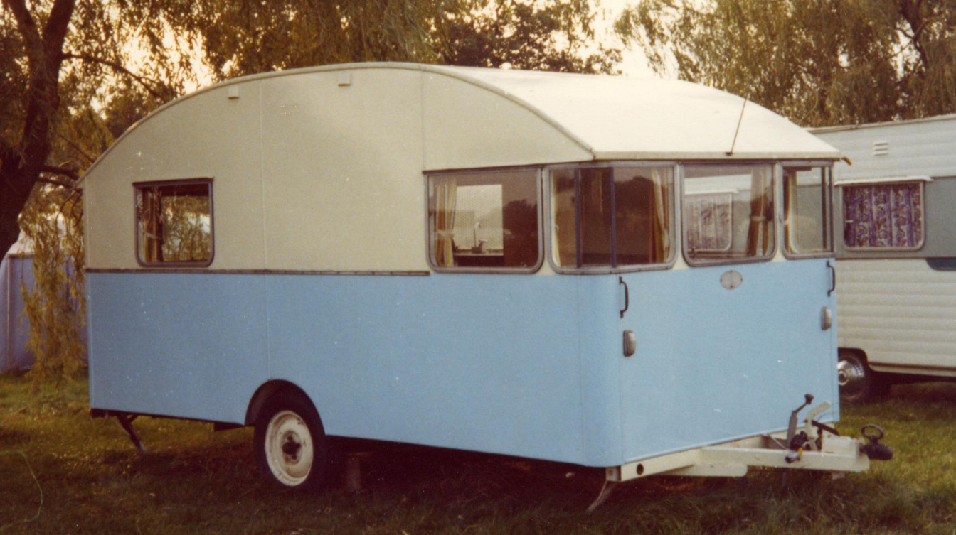
1956 Sprite 14