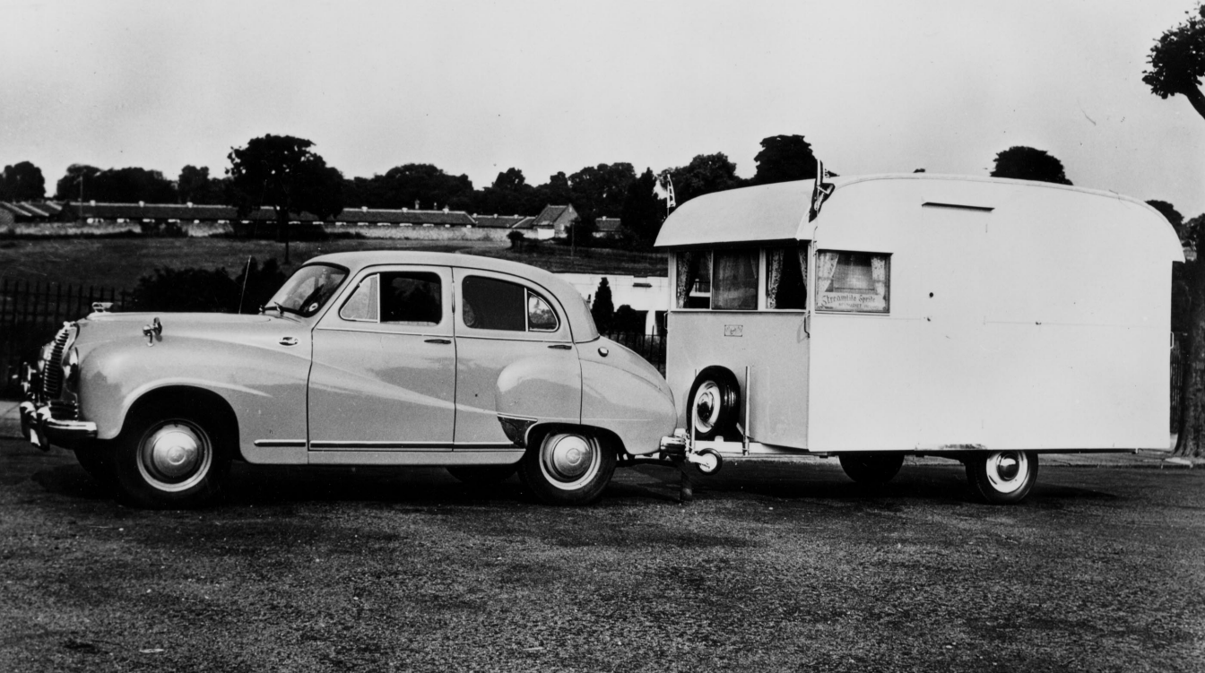
1951 Streamlite Sprite The definitive model which built the name