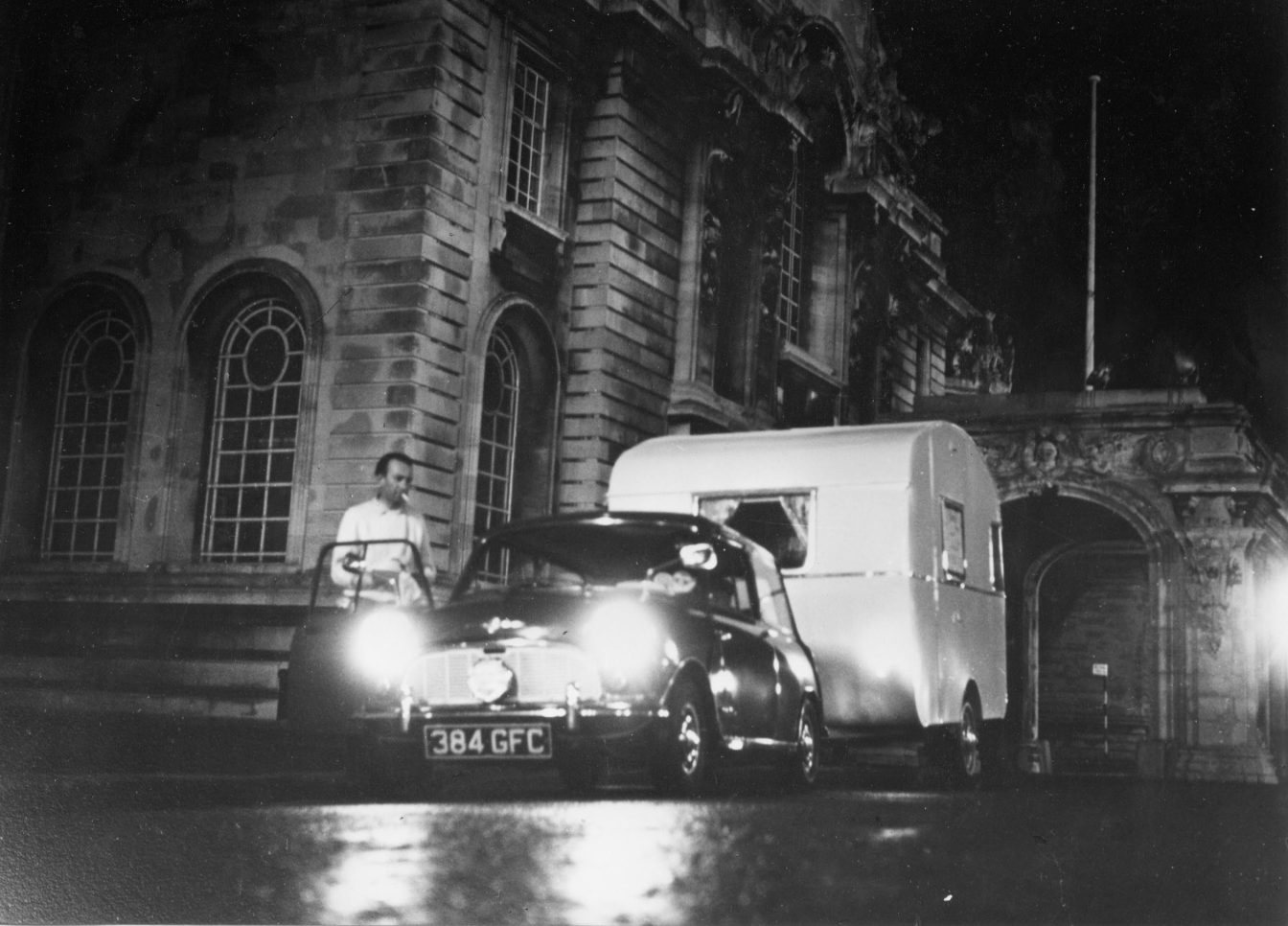
1960 Five capitals in 38hrs 54mins 29.46mph, 825.8miles