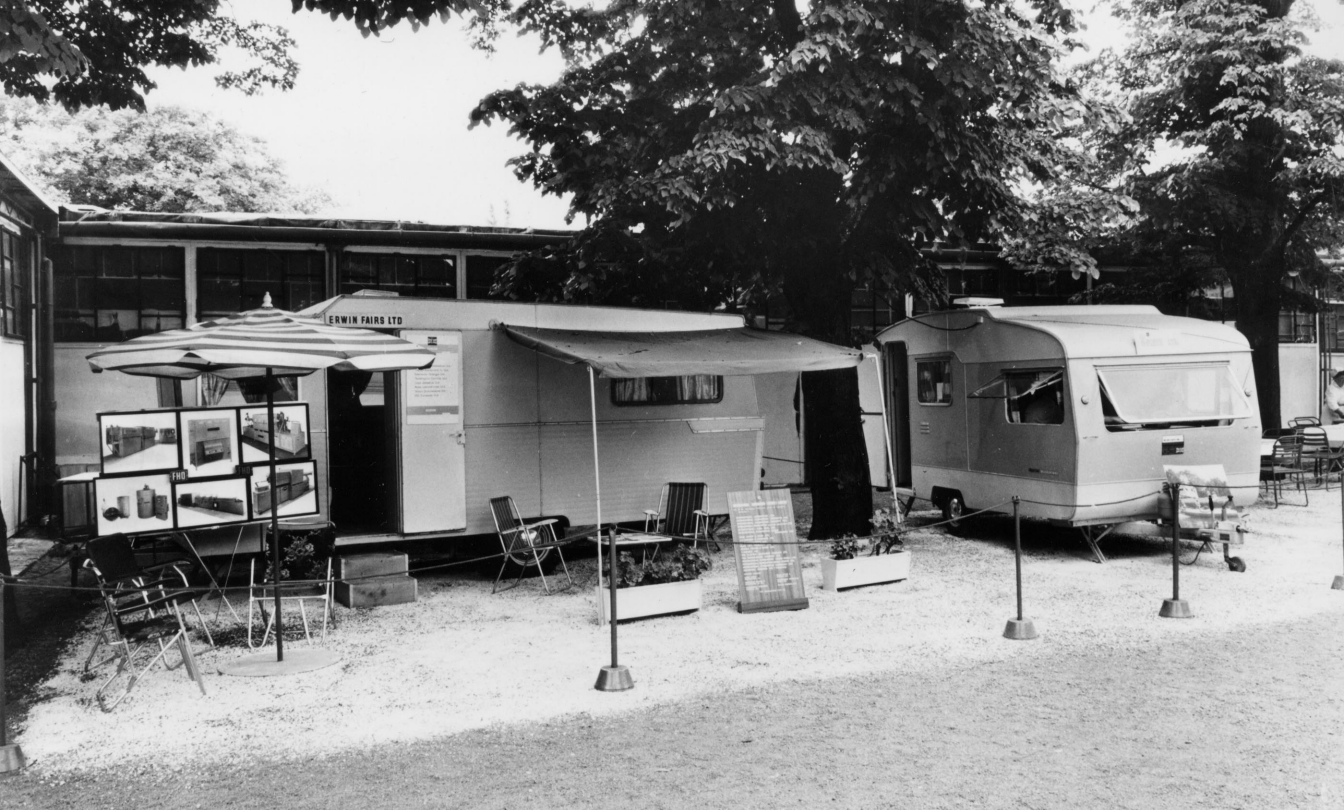
Budapest International fair 1966