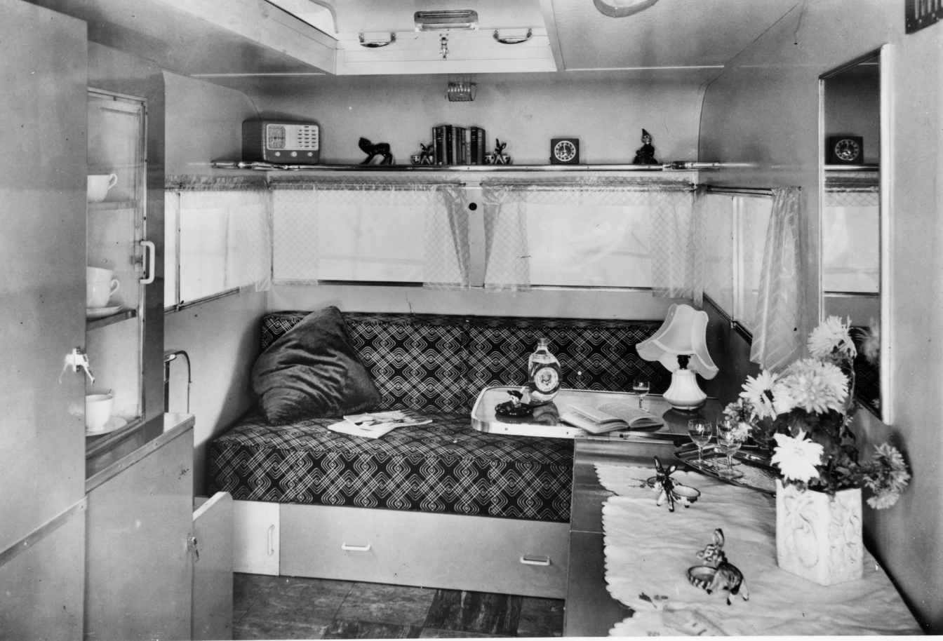
Streamlite Rover, view to front