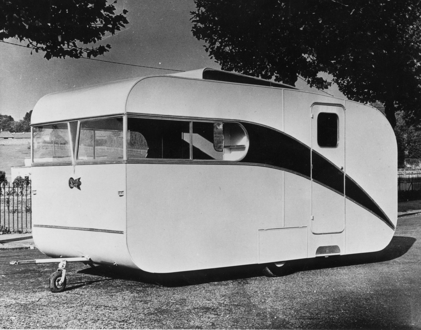
1948-49 Streamlite Rover with air brakes and Spitfire wheels