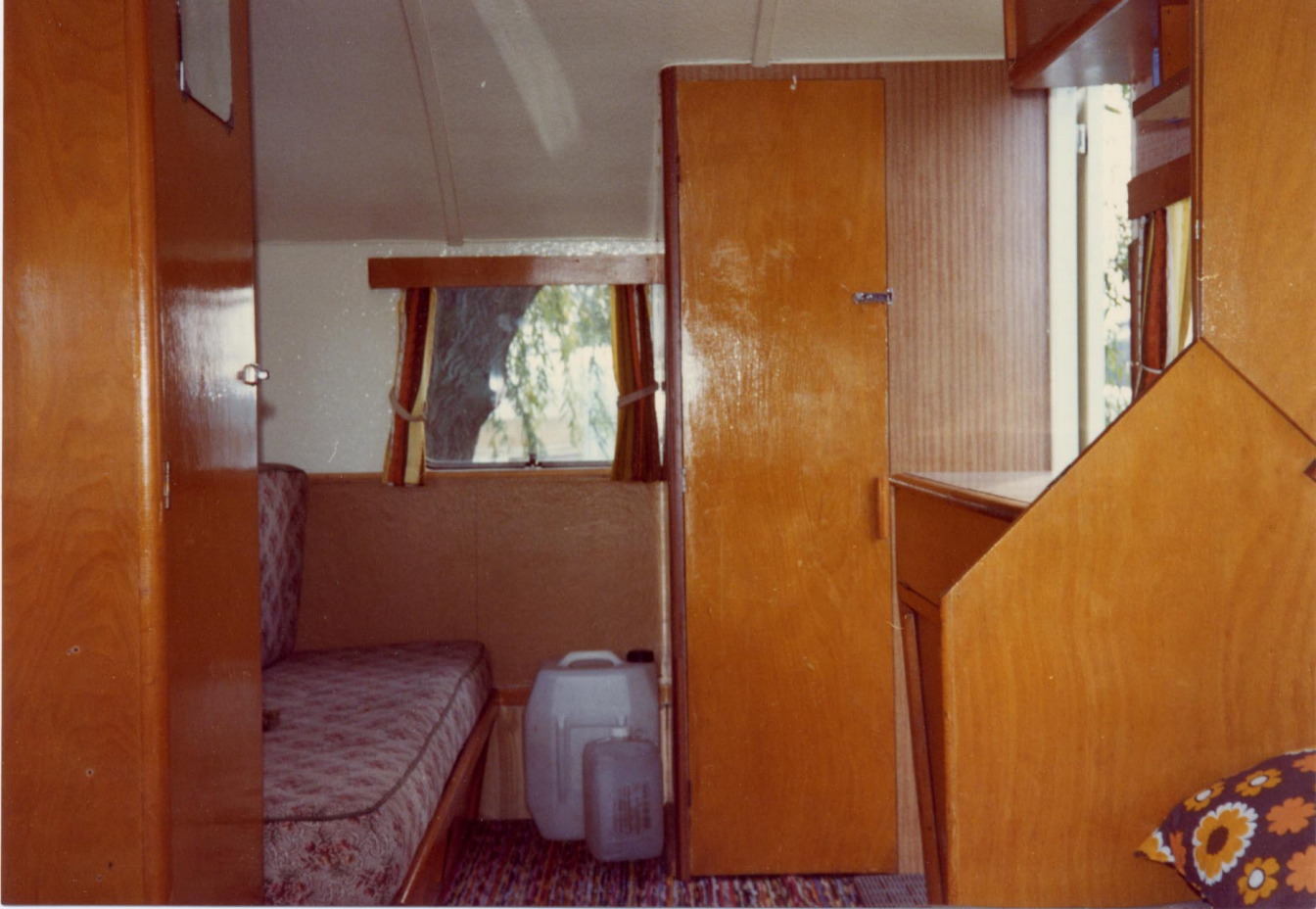
1956 Sprite 14