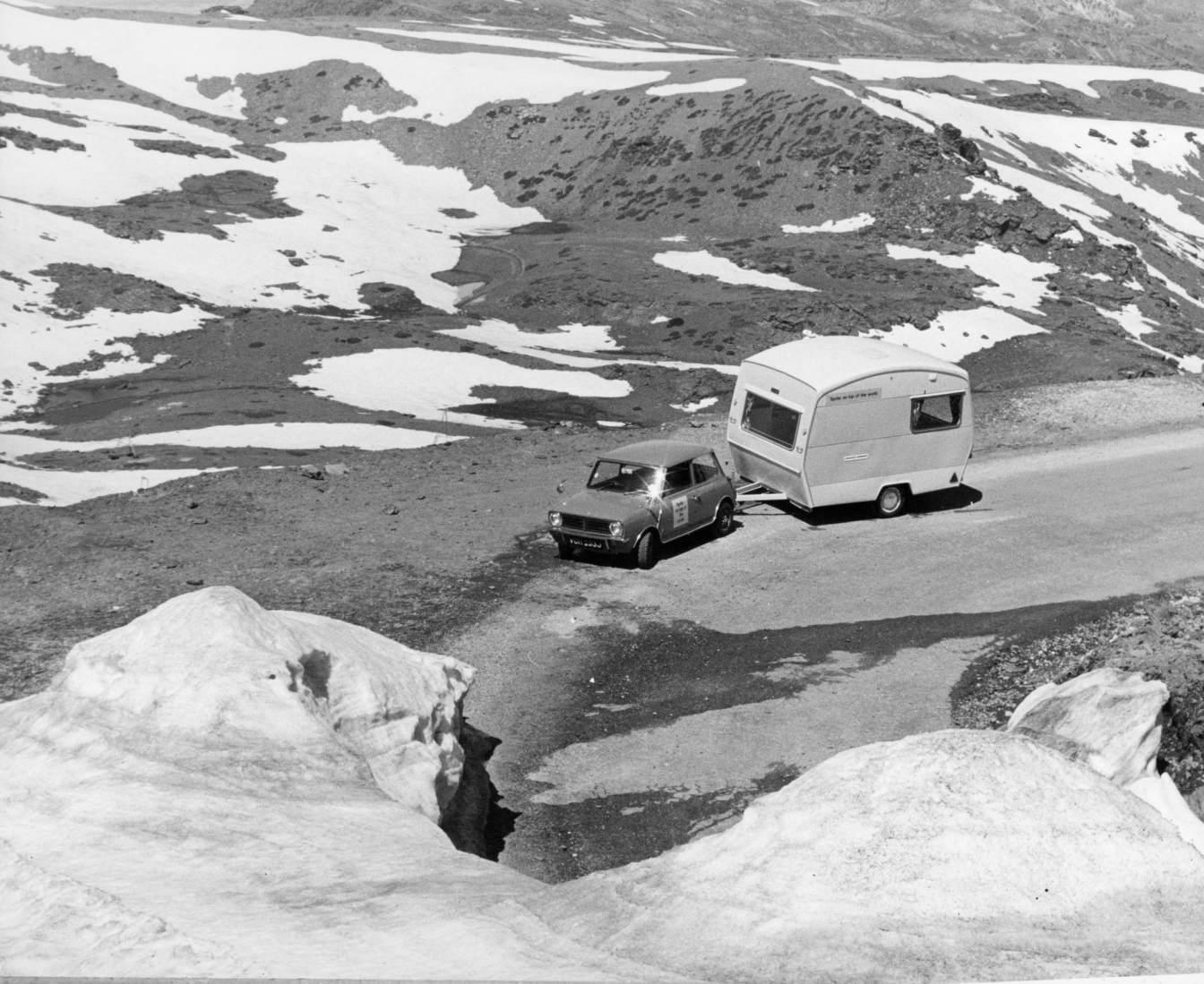
Sam Alper tows Sprite 400 to highest motor road in Europe on 10,000ft-plus Sierra Nevada. Date uncertain.