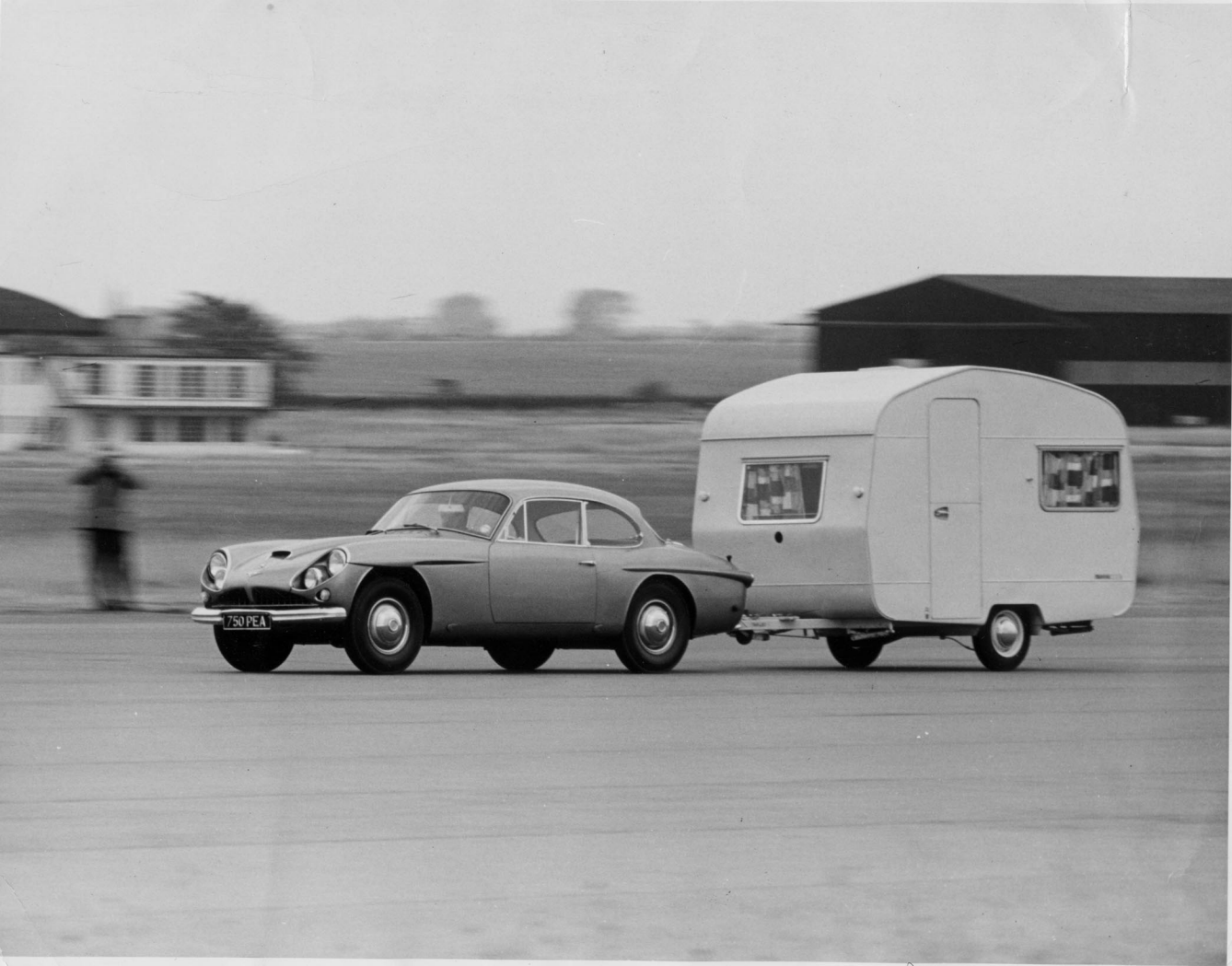
Sprite 400 during speed trials at Duxford airfield, Sept 30th, 1964.

A top speed of 101.9 mph was attained. (noted on Photo) 1864-27B (pencil on Photo)