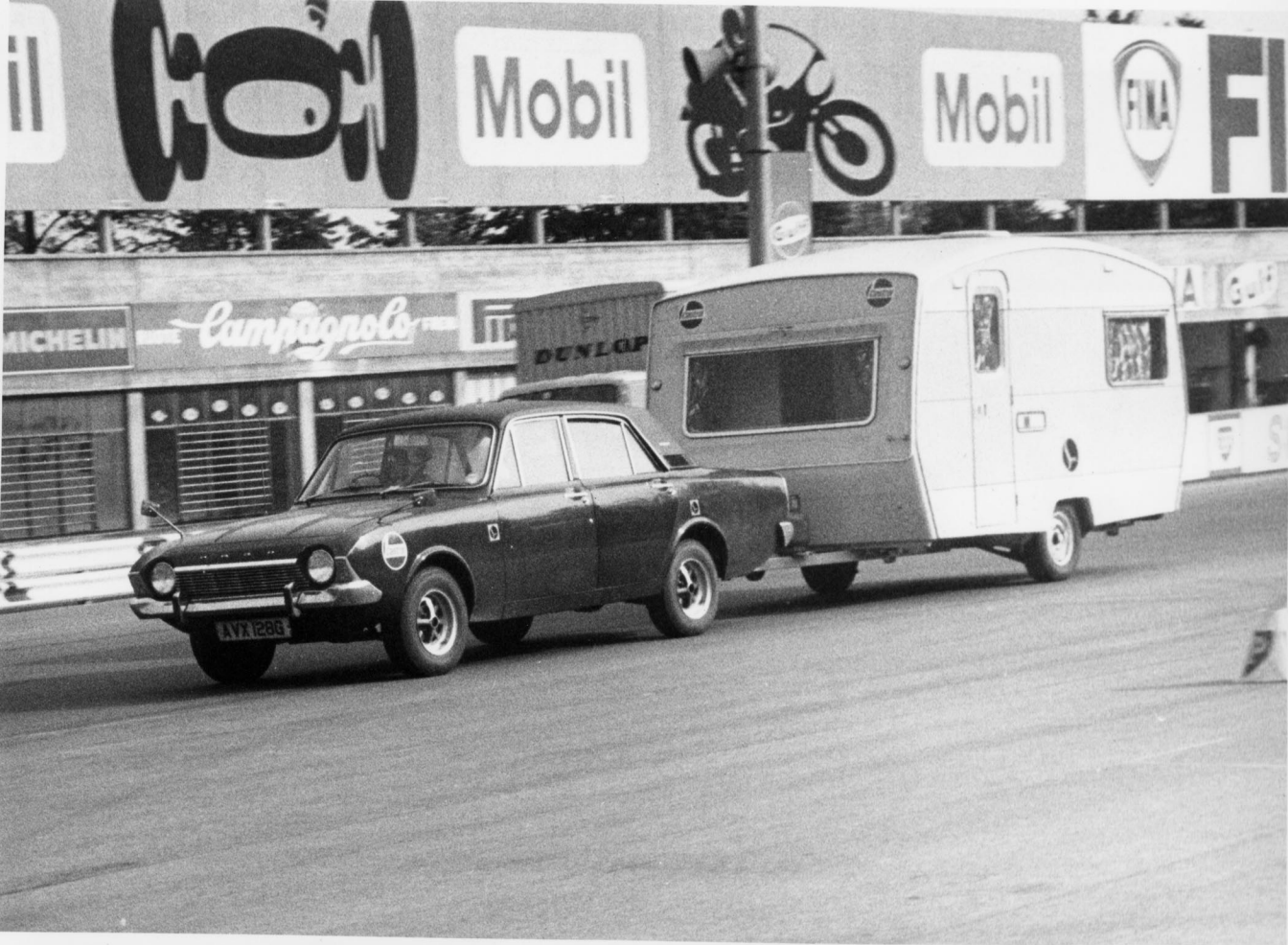
Monza endurance run 1969