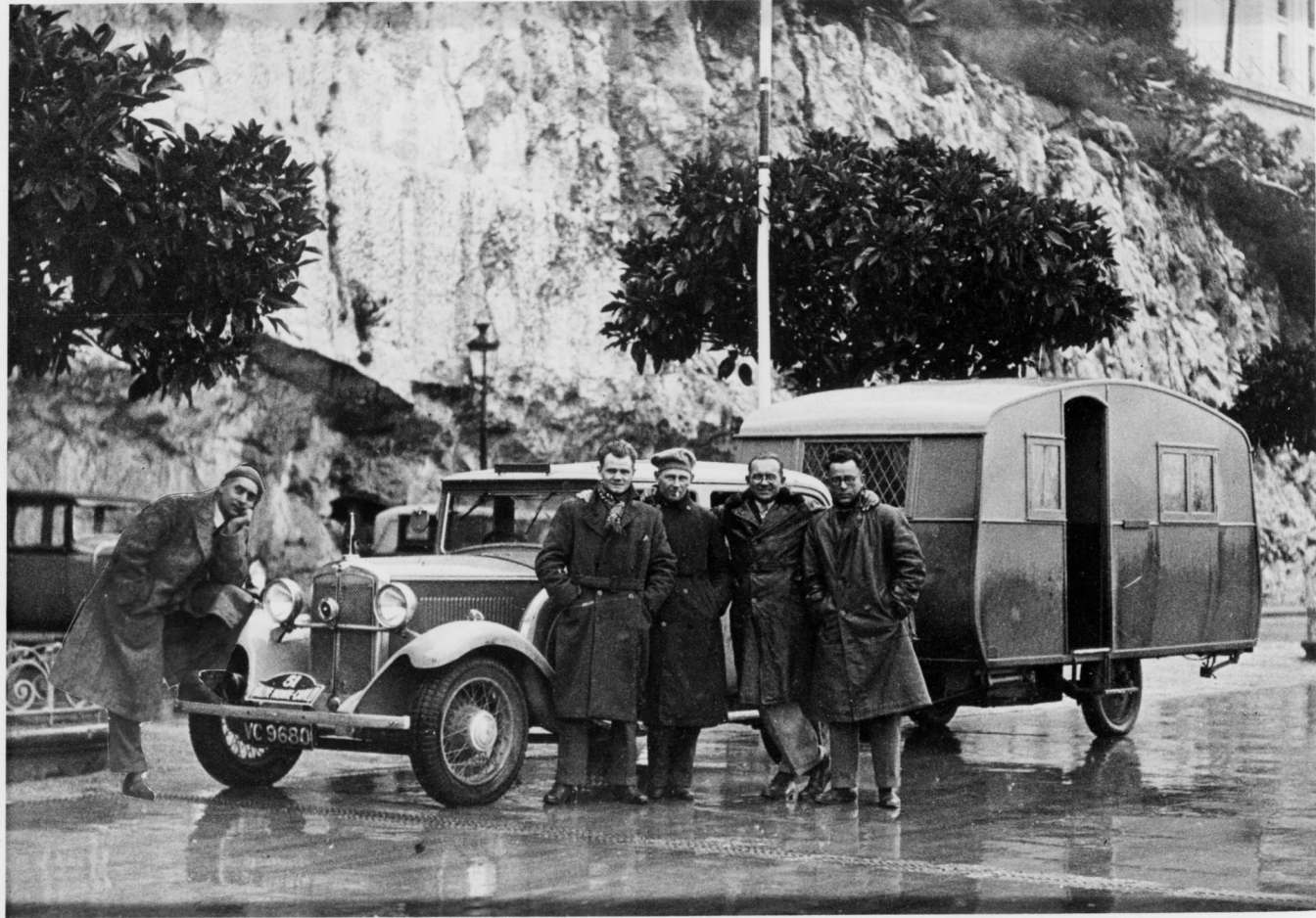
1932 - Monte Carlo Run