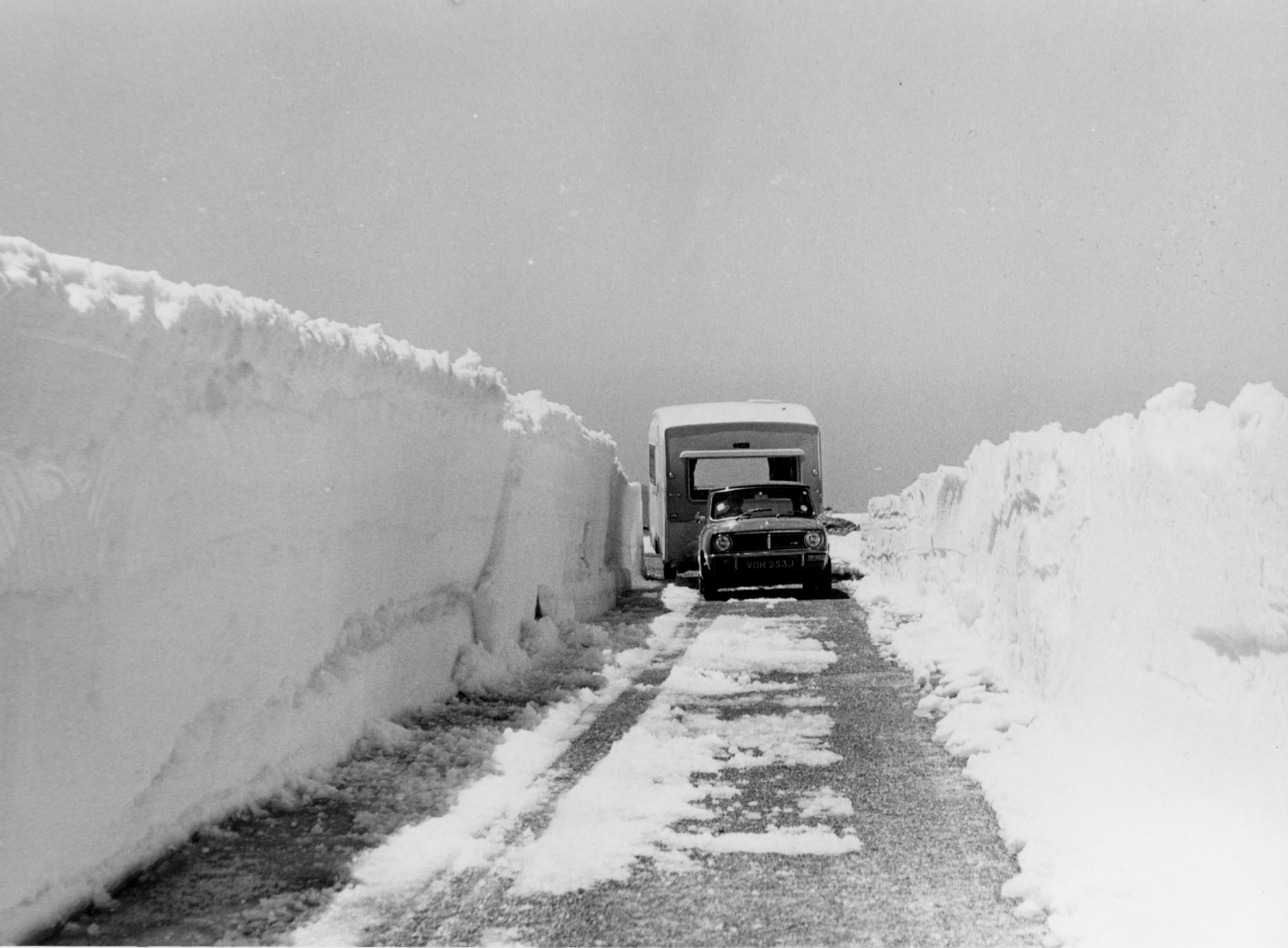
Sam Alper tows Sprite 400 to highest motor road in Europe on 10,000ft-plus Sierra Nevada. Date uncertain.