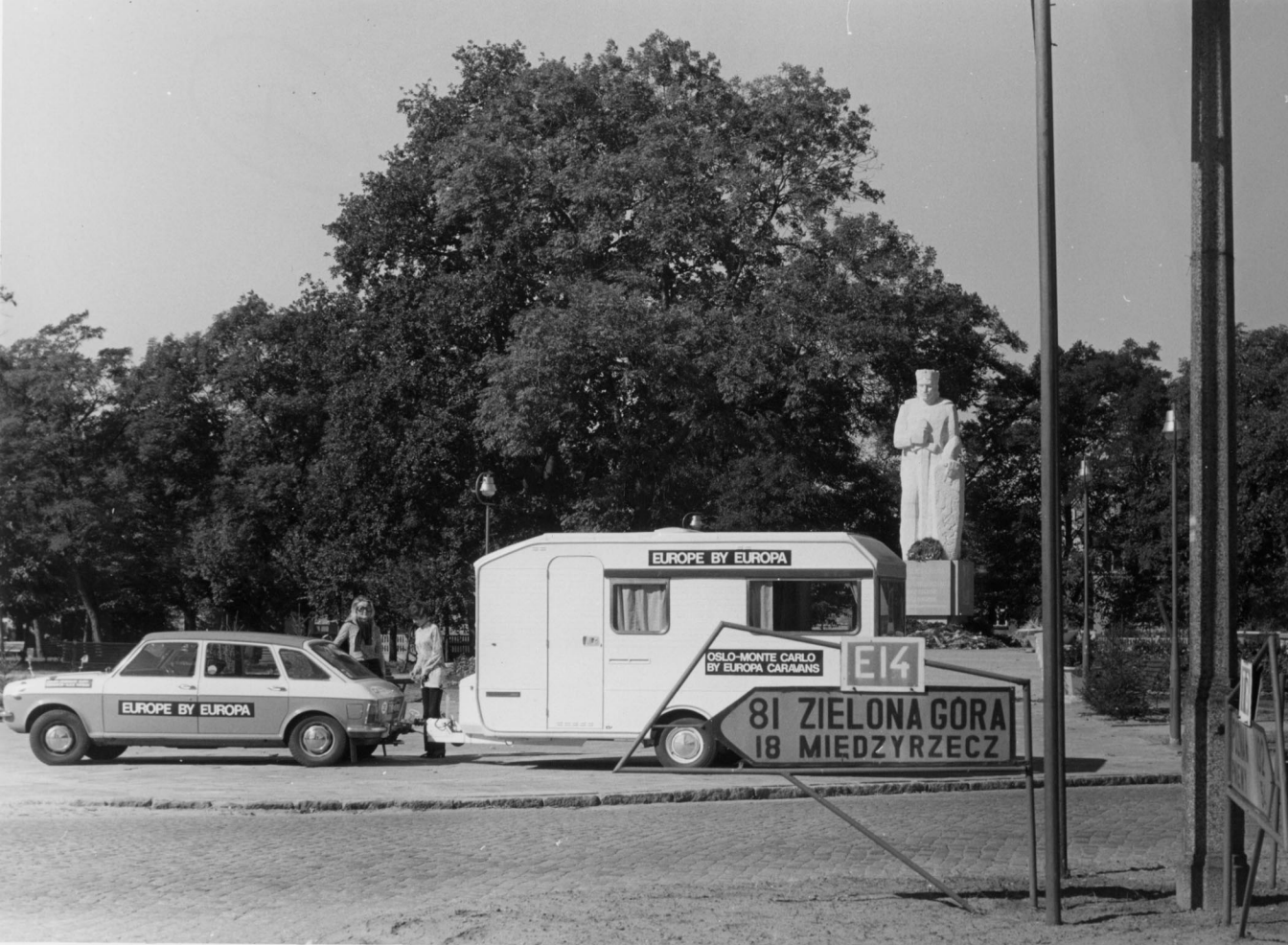
1970 - Launch of the first Newmarket built Europa, covered Monte Carlo rally route, Oslo to Monte via Poland-Czechoslovakia etc.