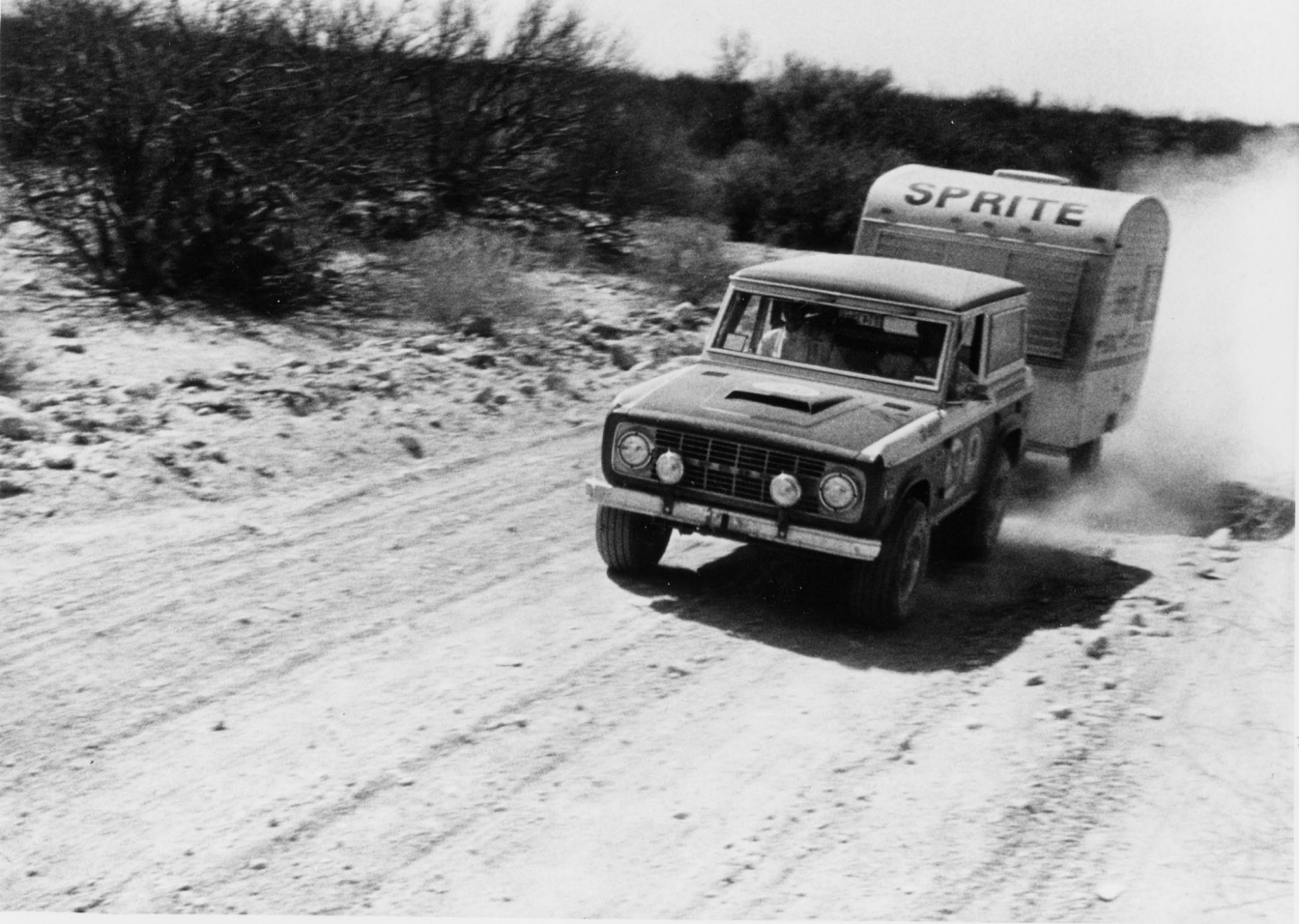
Ford Bronco and Sprite 400 travelling at 85 mph on one of the better roads during the Baja race (California, US built Sprite). 1971