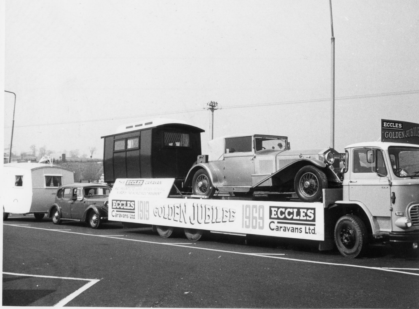
Eccles Golden Jubilee 1969.

This Eccles was presented to Baden-Powell by the Scouts of the World in 1929, in addition to a Rolls Royce. (HCC Note - The car in the picture is not the one shown in the 1929 photo of the presentation.)